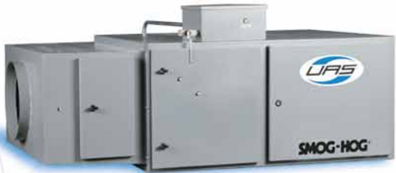
SHN-20 with optional inlet plenum

SHN/SG units are equipped with airflow capacities ranging from 400 to 9,000 CFM. Systems can be ducted, unducted, free hanging and machine-mounted, depending on your specific application — eliminating the need to give up valuable floor space in your facility!